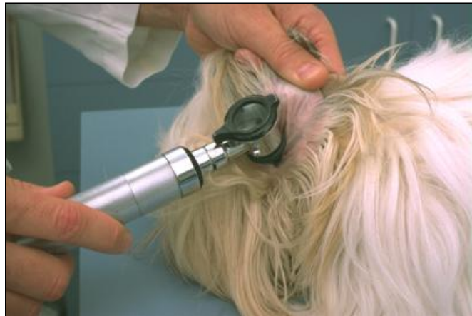
Otosopic exam of ear canal.

The results of the otoscopic and microscopic examination usually determine the diagnosis and course of treatment. If there is a foreign body, wax plug or parasite lodged in the ear canal, the dog is sedated for removal. Some dogs must be sedated to allow a thorough ear flushing and cleaning. Cytologic study of debris from the ear canal determines which drug to use. Many dogs will have more than one type of ear infection present (e.g., a bacterium and a fungus, or two kinds of bacteria). This situation usually requires the use of multiple medications or a broad-spectrum medication.