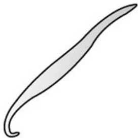
Hookworm (5x actual size)

Hookworms are intestinal parasites of the cat and dog. Their name is derived from the hook-like mouthparts they use to anchor to the lining of the intestinal wall. They are only about 1/8" (two to three mm) long and so small in diameter that they are barely visible to the naked eye.